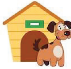
IN FRONT OF